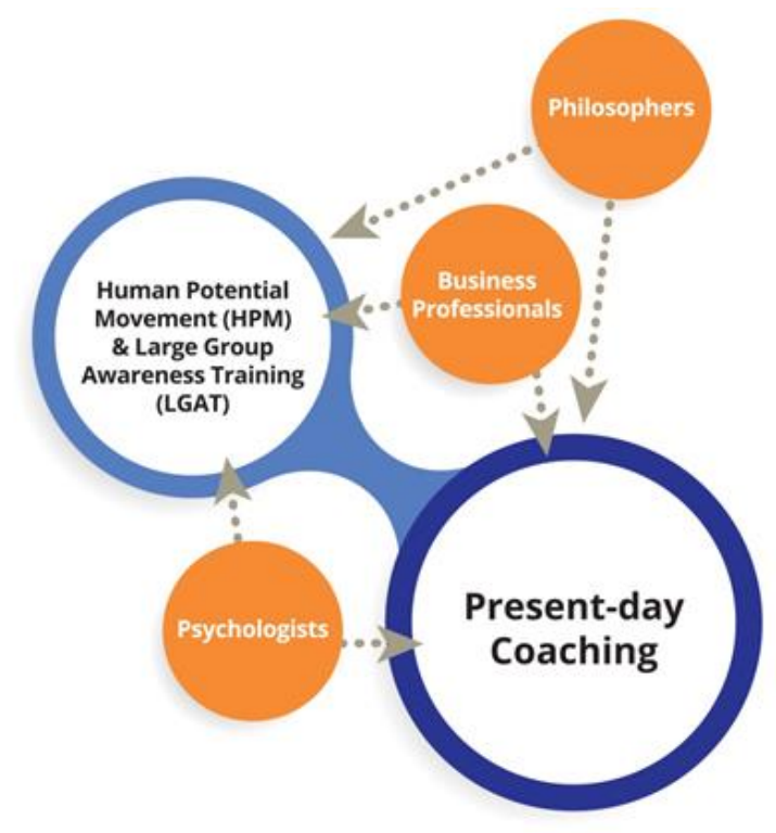
Figure 2. Influences on Coaching

Carl Rogers was one of the founders of the field of humanistic psychology. He emphasized the need to focus on and maintain a presence with the client (Rogers, 1957). Albert Bandura, a social psychologist, provided a significant contribution to